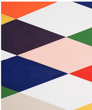
Reclining Harlequin, 2015

The tools have changed. I sometimes use Photoshop but only for getting a general idea of color distribution. Not shape distribution because that's already inherent in the grid. Also Photoshop is just measuring. I can take this whole thing and shift it sideways so that nothing lines up, according to the proportions of the rectangle, and maybe tilt it a little bit so it torques. That's a really queasy, crazy thing but you don't know where the points are. So Photoshop will just go like "Oh the points here, and the points here" and this is how many centimeters or how many inches. Once you have your basic outline you can use your ruler again and do the same intersections.