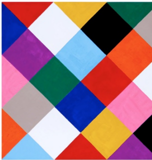
Untitled, 2014, gouache on paper

They take months. Sometimes they take a year. I work on many at once, and different colors dry at different speeds. I've noticed the cadmium reds take much longer to dry, for instance.