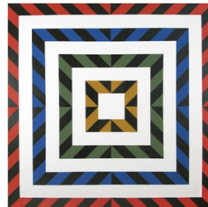
Within You and Without You, 2008

Right, well I start with a drawing. A sequence or constellation of several variations on an idea about a pattern that is geometrically clear and locked into the borders of the canvas, even when it doesn't appear to be. A lot of work is about making it not appear like it is locked in. However with tools like Photoshop , you can fix this point of measurement before you make the drawing. I still have to do everything by hand though. I don't use tape. Some people call me a hard-edge painter, but the only time I use tape is on the giant wall paintings, because you have to. But on the canvases it's all hand drawn and hand painted, the paint meets