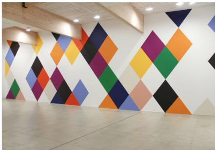
Canterbury, 2014, latex on wall, 180 x 540", Art OMI

I've been doing these Harlequin diamonds [showing me pictures of a wall painting on his iPhone]. This is from a show of paintings I had up at Art OMI two summers ago. What I did for the first time was to open up spaces in the Harlequin grid. Now instead of a forty-five foot wall painting, this painting is part of a series where I've done the same thing.