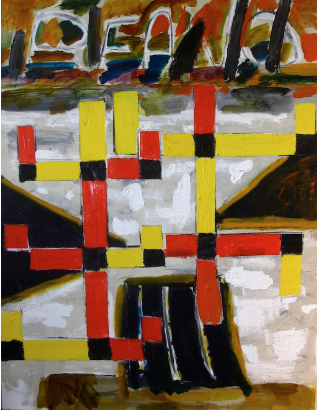
John Walker, "Looking Out to Sea II" (2012), oil on canvas, 84 x 66 inches

JS: This makes me think of your paintings of Seal Point, Maine. You made hundreds of small paintings of this single site. What inspired you to paint this motif repetitively?