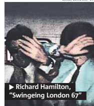
► Richard Hamilton, "Swingeing London 67"

photos and more dated 1969 from the Museum of Modern Art's collection, along with current "artist interventions." Will the re-